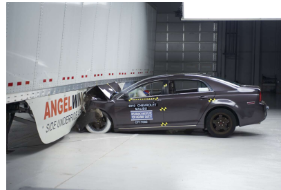
Crash into weak rear underride guard: