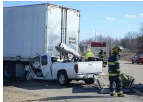
Marshall, Michigan, 2013