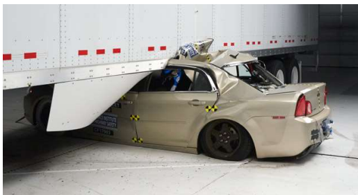
Side Underride Crash Test, 2017