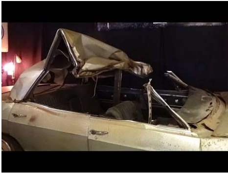
Jayne Mansfield's car, 1967